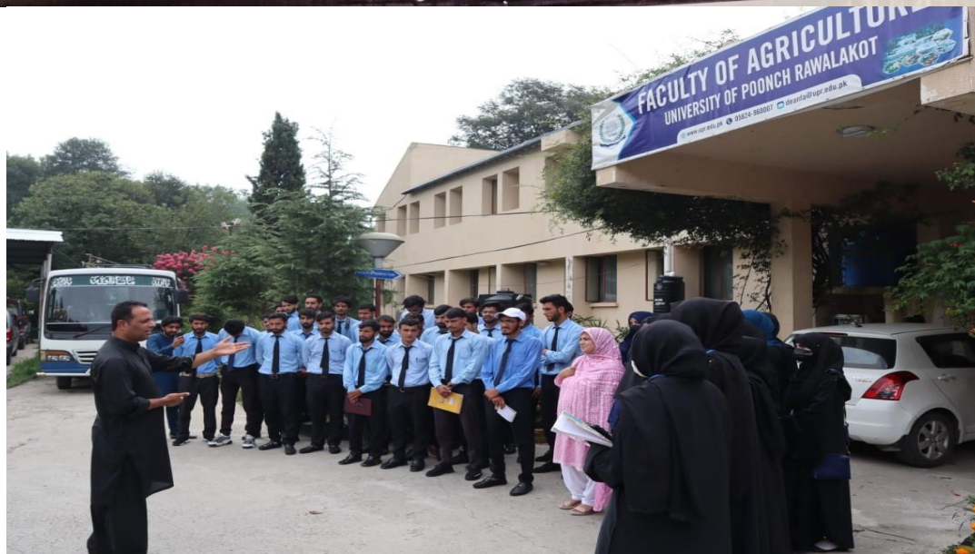
Few glimpse of different activities held in University of Poonch Rawalakot during 2023 for the promotion of quality education